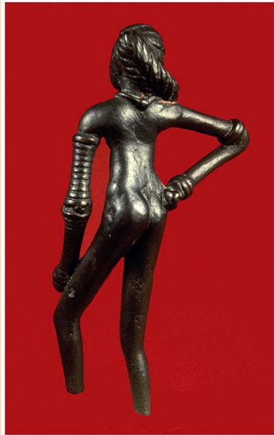
Visual Source 2.3a Dancing Girl Chapter 2, Ways of the World: A Brief Global History with Sources, Second Edition Copyright © 2013 by Bedford/St. Martin's Page 106