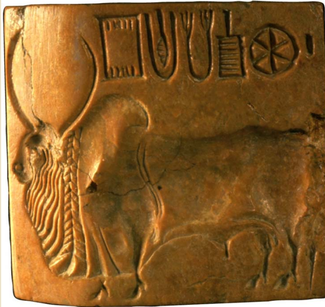
Visual Source 2.1 A Seal from the Indus Valley J. Mark Kenoyer/Harappa Images Chapter 2, Ways of the World: A Brief Global History with Sources , Second Edition Copyright © 2013 by Bedford/St. Martin's Page 104