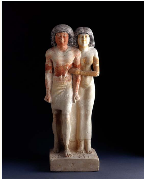
Raherka and Mersankh Chapter 2, Ways of the World: A Brief Global History , Second Edition and Ways of the World: A Brief Global History with Sources , Second Edition Copyright © 2013 by Bedford/St. Martin's Page 46 (page 60, With Sources)

1. Who does this statue represent? Describe the figure.