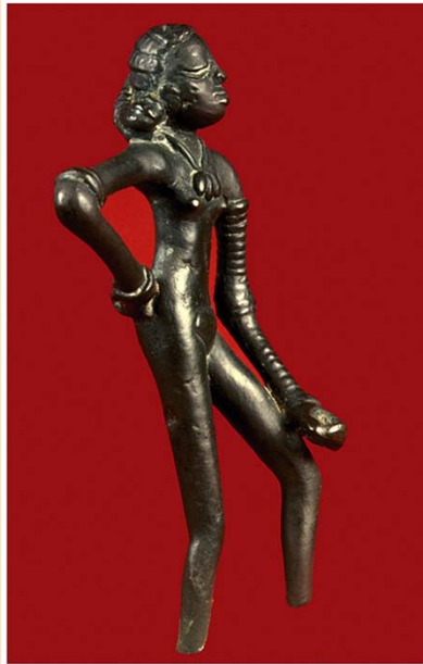
Visual Source 2.3b Dancing Girl Chapter 2, Ways of the World: A Brief Global History with Sources, Second Edition Copyright © 2013 by Bedford/St. Martin's Page 106