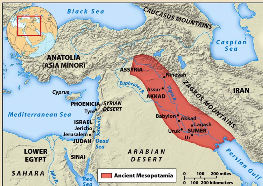
Map 2.2 Mesopotamia Chapter 2, Ways of the World: A Brief Global History , Second Edition and Ways of the World: A Brief Global History with Sources , Second Edition Copyright © 2013 by Bedford/St. Martin's Page 67 (page 81, With Sources)