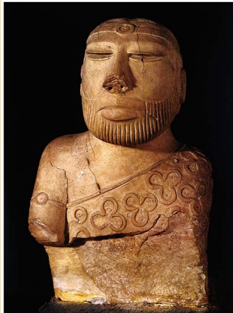
Visual Source 2.2 Man from Mohenjo Daro Department of Archaeology and Museums, Karachi, Pakistan Chapter 2, Ways of the World: A Brief Global History with Sources , Second Edition Copyright © 2013 by Bedford/St. Martin's Page 105