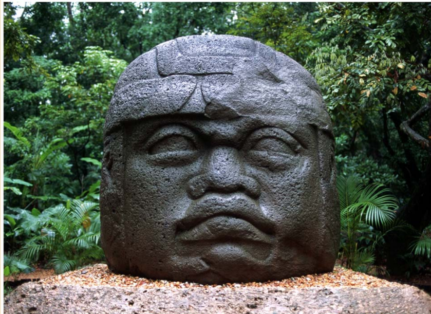
Olmec Head Chapter 2, Ways of the World: A Brief Global History, Second Edition and Ways of the World: A Brief Global History with Sources, Second Edition Copyright © 2013 by Bedford/St. Martin's Page 64 (page 78, With Sources)

1. What is this statue, and where is it located?